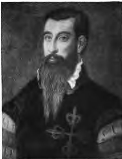
From a print in the Hispanic Society of America Garcilasso de la Vega